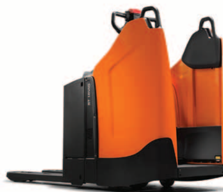
Optional fixed platform and sideguards