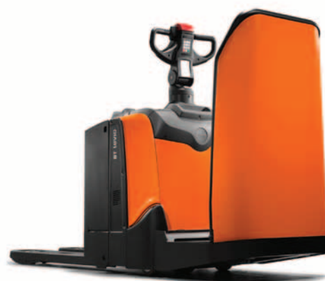
Optional fixed platform and backrest