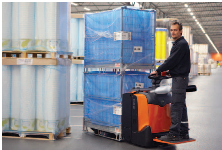
Standard model with flip-down platform and foldable sideguards